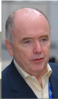
Jack Dromey MP for Erdington

I am thrilled to see the church at Six Ways being so involved in the wider community."